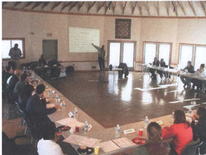
Bryn Gweled Co-Laboratory